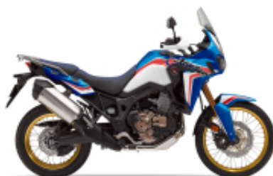
Africa Twin CRF 1000 L + $1,200.00