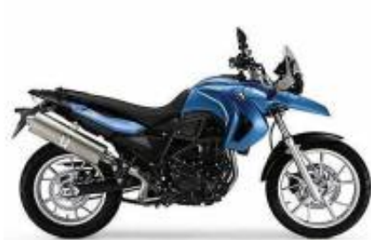
G 650 GS Twin + $700.00