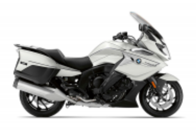
K 1600 GTL + ¥103,241