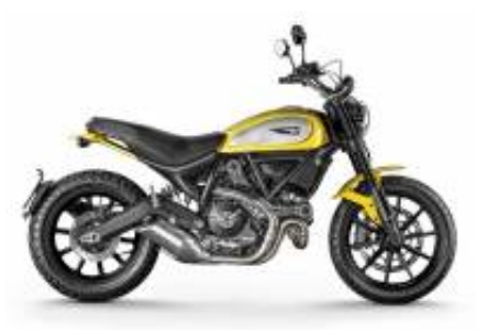
Scrambler Icon 800 + ¥43,017