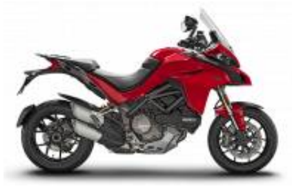
Multistrada 1260 + ¥86,034