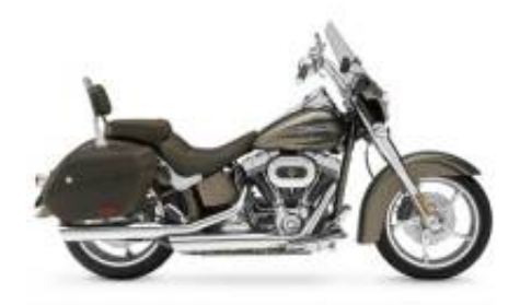
Softail + $944.31