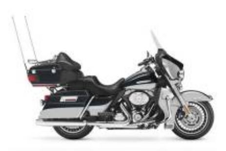
Road Glide Ultra Grand Touring Class + $944.31