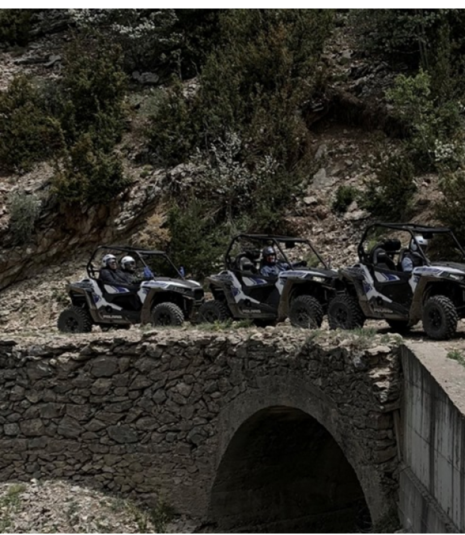
Buggy tour Morocco