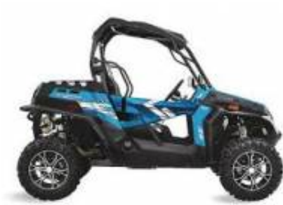
CF MOTO Z-FORCE EX 4x4 + $1,070.63