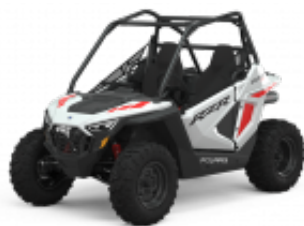
RZR 700 + $1,070.63