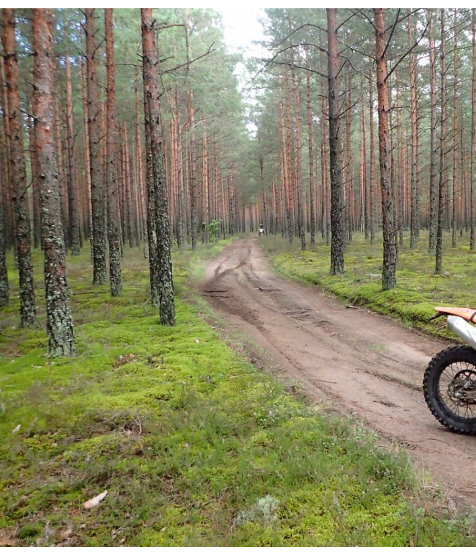
Motorcycle Enduro off Road tour Lithuania