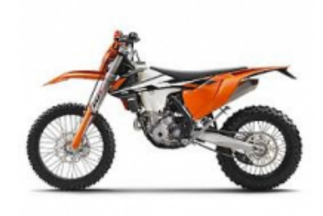
EXC 350 + ¥0